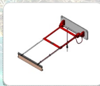
Pipe electrode - arm 5700-1077

Note: Due to ongoing technical developments, all stated information is typical and is subject to change without notice or obligation.