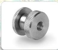
Knurled thumbnut and backnut 6005-0465