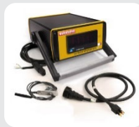
Surface Display Pro' 6004-0079