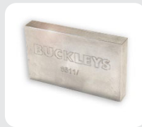
Zinc Test Block 6004-0052