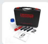
BathyCorrometer® Calibration Kit 6004-0031