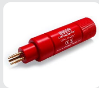
CalChecker Pro' 6005-0080