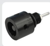
Silver/Silver Chloride Half-Cell 6005-0051