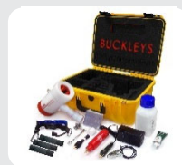
BathyCorrometer® Pro' Complete Kit 6004-0077