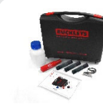
BathyCorrometer® Calibration Kit 6004-0031