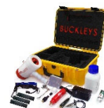
BathyCorrometer® Pro' Complete Kit 6004-0077